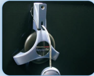
a. Suction cup

There are 2 ways to place the SpyderTV colorimeter on your screen: